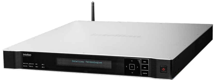
Below Deck Terminal (19" Rack Type 1U)