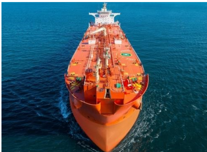
Navarino has installed more vessels with FX than any other VAR in each quarter of 2017 so far.

Navarino offers Fleet Xpress in combination with Infinity Plus or Infinity Cube and with the soft version of the Network Service Device hosted on these Infinity types. This gives customers one box with both the tools needed to manage and operate Fleet Xpress and the full functionality and the virtualization options of the Plus and the Cube. What’s more, with the Cube, customers are able to take advantage of the full redundancy it provides, meaning that if one node fails, all functionality and the soft NSD move seamlessly to the second node, which is a unique selling point in the maritime satellite communications market.